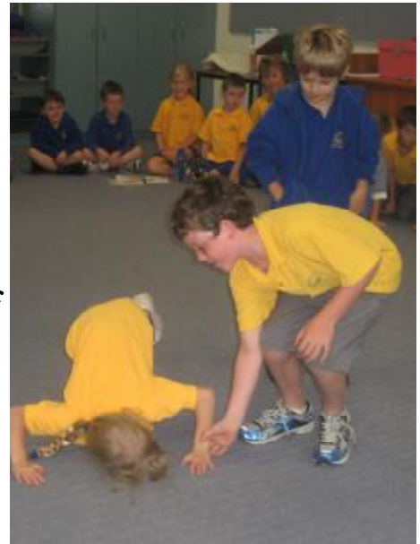
I tell the truth in a tactful way.

This week we are focusing on the value of 'Caring'. On Friday the whole school discussed how we show the value of Caring. We then worked together on showing role plays of the value.