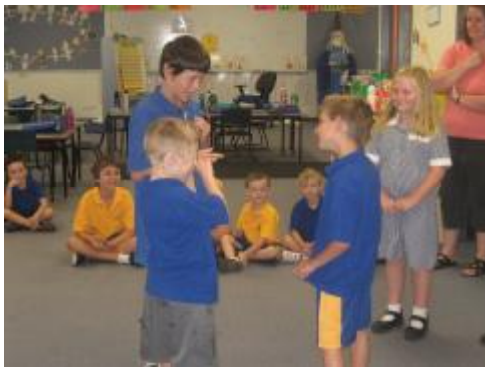
Everyone has the right to feel safe.