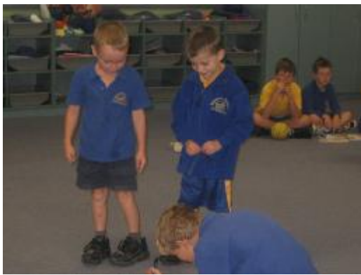
I have zero tolerance of bullying.