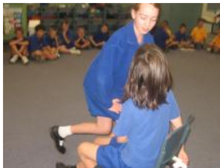
I encourage humour and laughter.