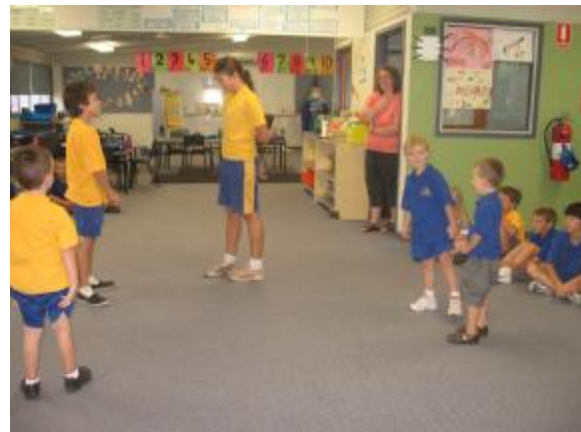
I build positive relationships.